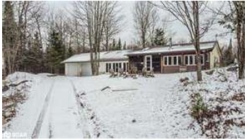
Snow covered back of property featuring a fire pit and a detached garage