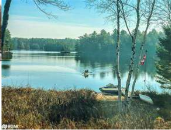
Deeded Waterfront with private dock on Tamarak Lake. Just across the road!