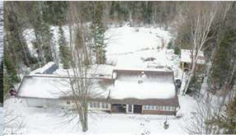
Cottage with private pond behind