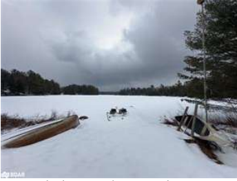
Deeded Waterfront with Private Dock