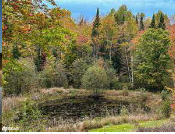
Pond at back of property