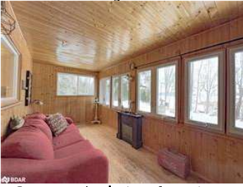
Sunroom / solarium featuring a wood stove