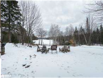
Fire Pit Lake Views