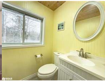
Half bathroom featuring toilet & vanity