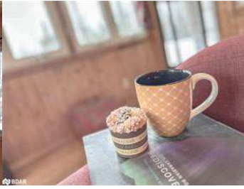
Coffee in the sunroom